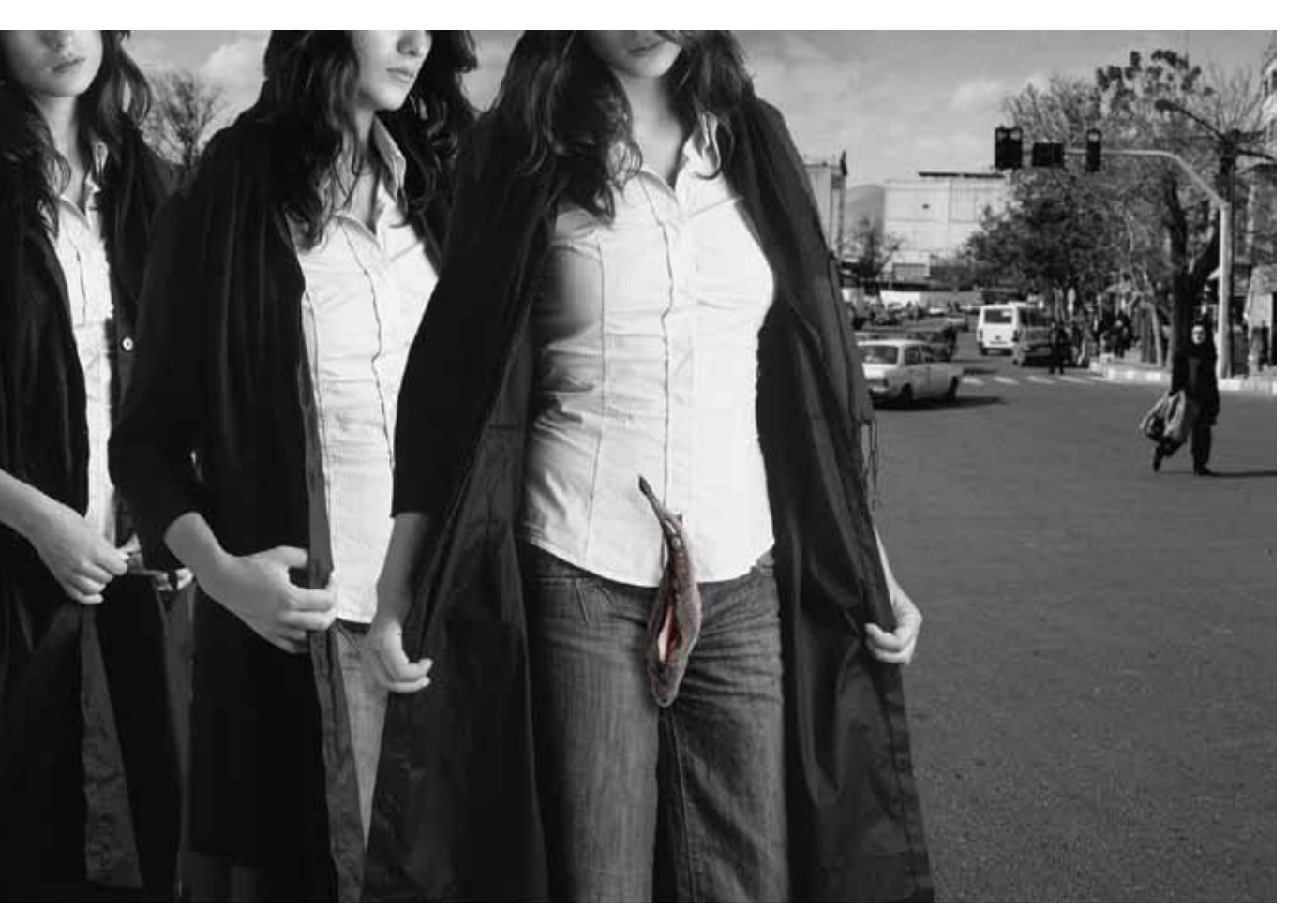
Remained Objects series \mid 110 x 180 cm \mid Editions of 4 + 1 AP \mid 2010

been subjected to extreme repression by the government machine, Persian poets created a special lexicon with inferences quite unlike those intended for the original terms. With such a lexicon having been entered into classical Persian poetry, audiences have gradually learnt to treat these hidden inferences as literary codes which are deciphered during the process of reading.