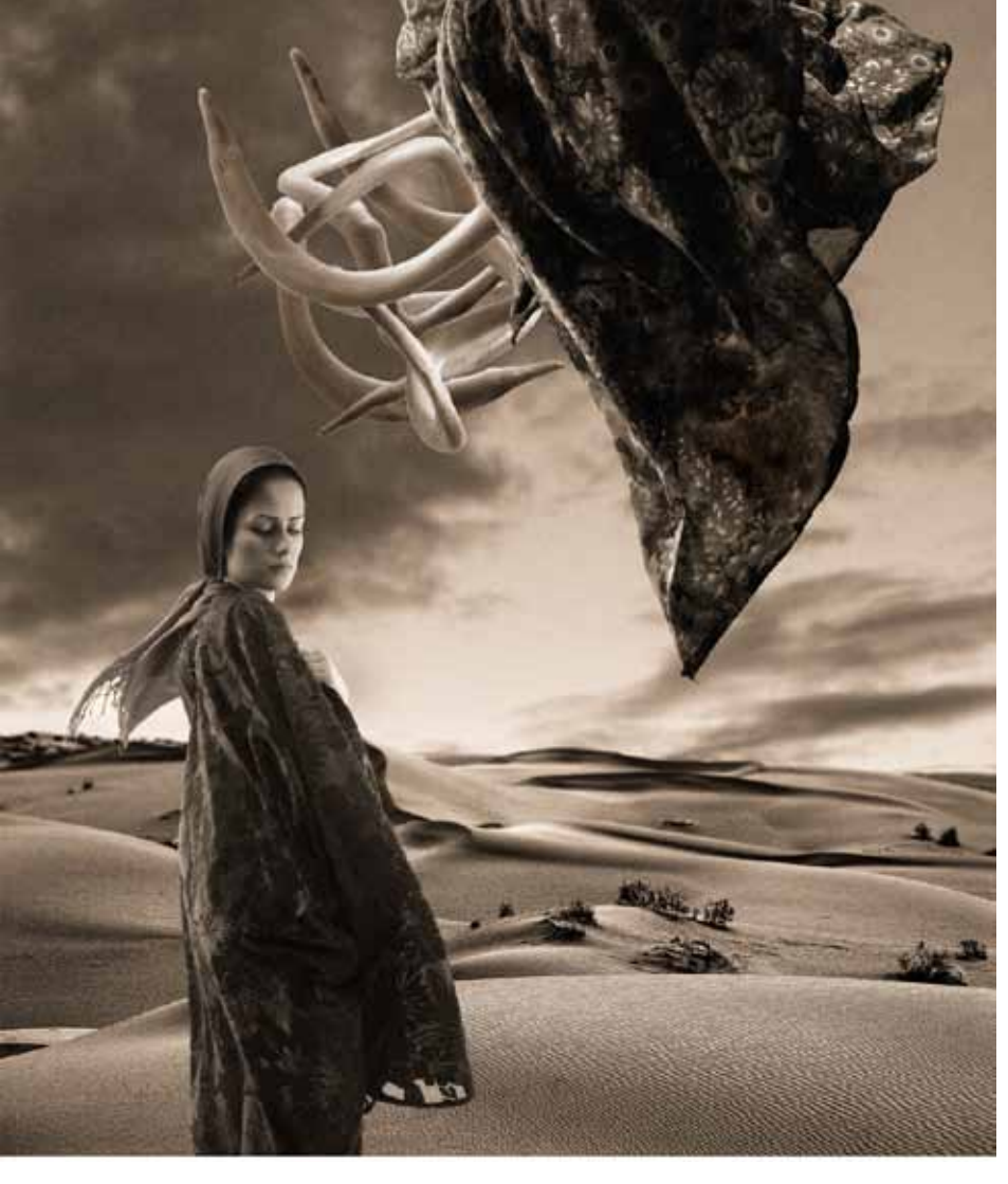
Remained Objects series \mid 110 x 180 cm \mid Editions of 4 + 1 AP \mid 2010

then the presence of women in these images, especially with such poetic appearances, would gain new connotations. A large slab of bone positioned in the place of a woman's breasts, while a pile of bones adorns another woman's head, resembling the Crown of Thorns (Witness – Remained Objects Series).